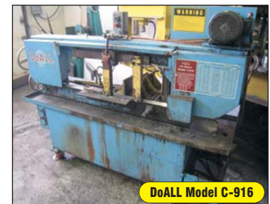
DoALL Model C-916

CONTACT ASSET SALES - www.asset-sales.ca - 902-852-5331