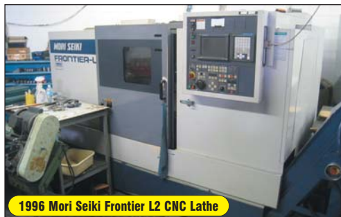
1996 Mori Seiki Frontier L2 CNC Lathe