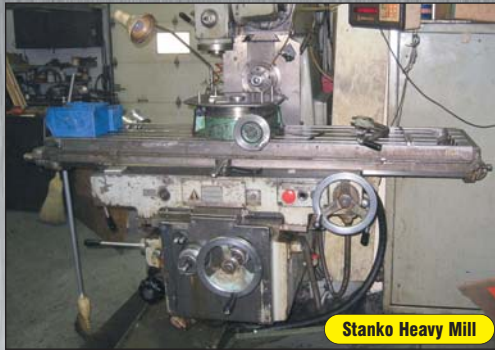
Stanko Heavy Mill

Friday, March 1 to Wednesday, March 6, 2013