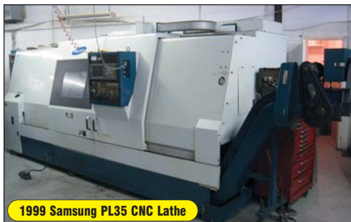
1999 Samsung PL35 CNC Lathe

Bidding will be conducted via www.bidspotter.com