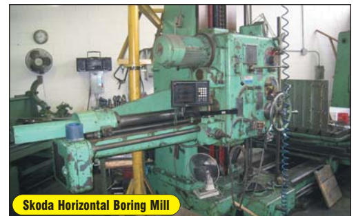
Skoda Horizontal Boring Mill

Asset Sales (Canada) Inc. auctioneers * appraisers * real estate brokers Phone: 902.852.5331 * Fax: 902.852.5330 www.asset-sales.ca