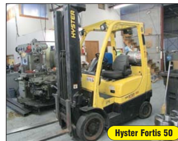
Hyster Fortis 50

Inspection: Tuesday, March 5, 2013, 8:00 am to 4:00 pm