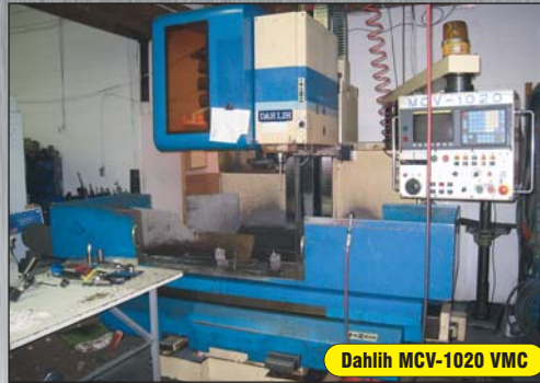
Dahlih MCV-1020 VMC