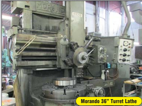
Morando 36" Turret Lathe