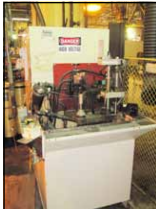
INDUCTO Heat Induction Hardener