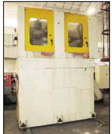
FEDERAL Pot Broach