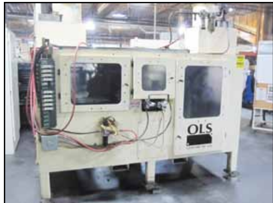
OLS Deburning Machine