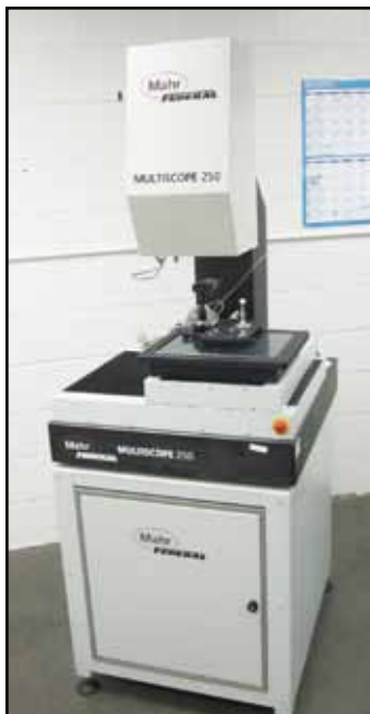
MAHR Multiscope 250