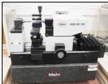
MAHR 828-UN-120 Calibrator