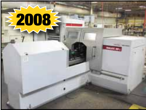
PROFIROLL Rollex HP CNC Spline Roller