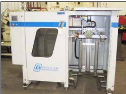
DISTECH Fifo DS-100 Parts Tray Handling System