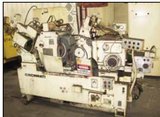
CINCINNATI 325-12 Centerless Grinder