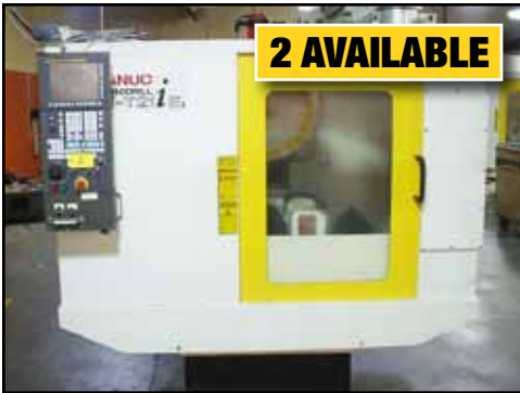
FANUC a-T21EL CNC Robo Drills