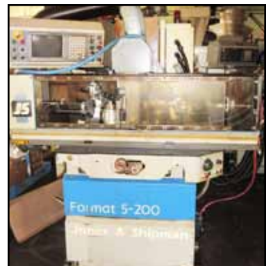
JONES & SHIPMAN CNC Grinders