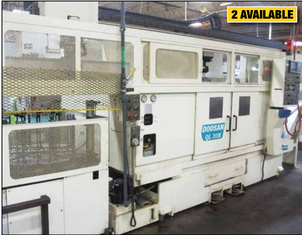
DOOSAN QL 30H CNC Turning Center

ONLINE BIDDING ONLY ~ Register at www.bidspotter.com