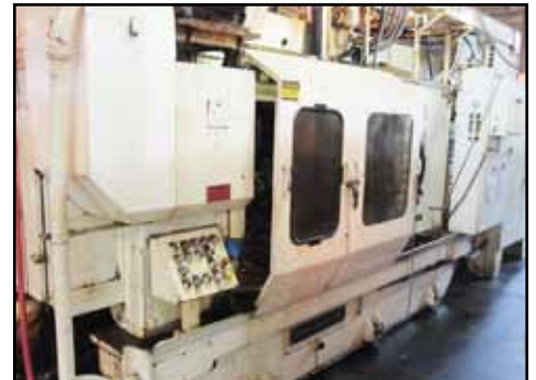
CONOMATIC 4-6SZC Screw Machine