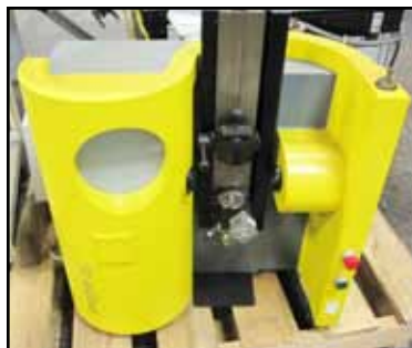
BROWN & SHARPE Tesa 25