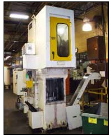
FEDERAL ID Broach