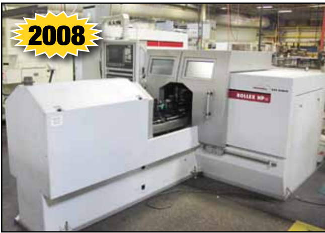
PROFIROLL Rollex HP CNC Spline Roller