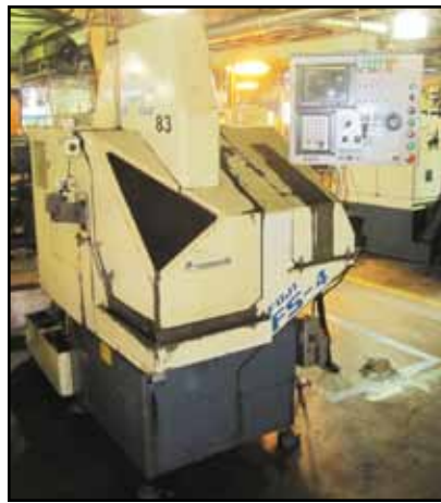
FUJI FS-4 CNC Lathe