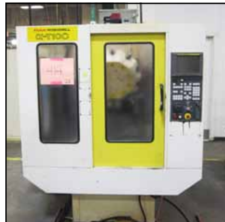
FANUC a-T10C CNC Robo Drill